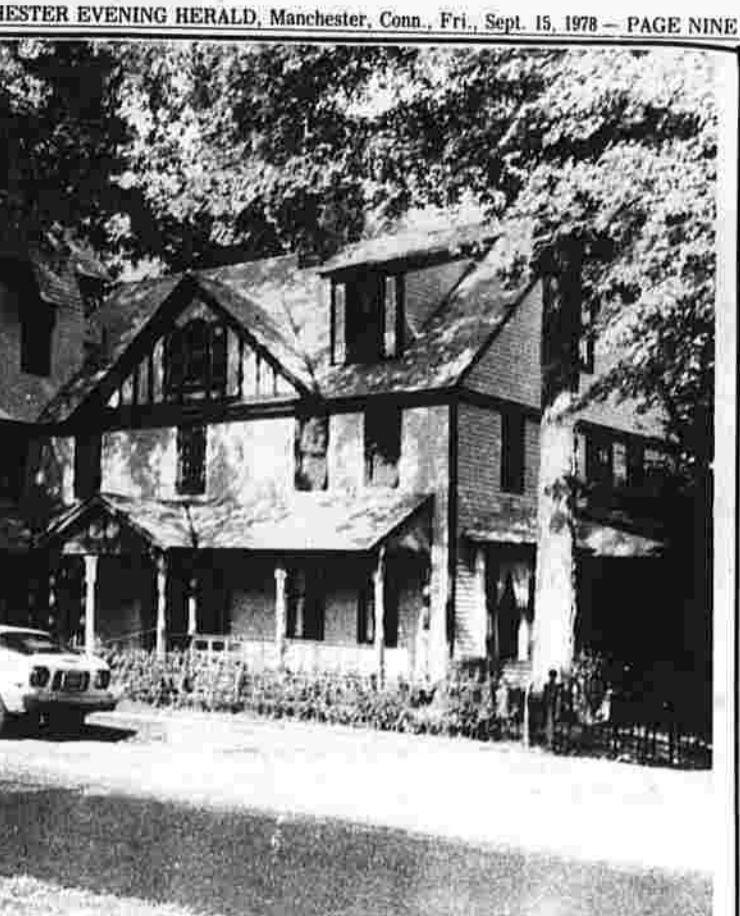
Restored Hicks Home on Tolland Green