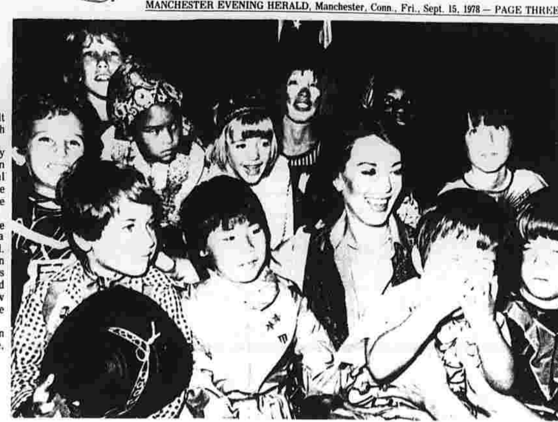
He Dislikes Publicity

Fame is not all that the little "trick-or-treaters" sitting on the lap of actress Natalie Wood thought it would be as he hides his face in tears during photo session. The kids joined Miss Wood as she was named chairwoman of the 1978 National UNICEF Day Campaign for the world's neediest children. Miss Wood will coordinate the annual Halloween Fund Raising Program where kids will collect money rather than candy.