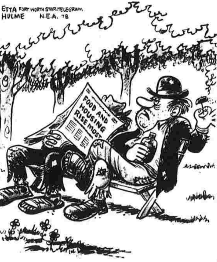
"I can still afford the luxuries — it's the necessities that blew me out of the tub."

There is little question that the present Manchester Board of Directors is working hard. The members have spent many hours working on town business, including the long nights that have been spent completing the board's monthly agendas. The detail of its review has led to a problem, however. The monthly agenda, as listed, provides two times for members of the public to speak. If the board meets twice a month, as has been tradition, the agenda is divided so that citizens have an opportunity to speak at each meeting. This board, however, often has been meeting three times a month. At one of the meetings, if the agenda is followed, there is no formal time for public comment.